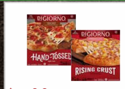
DiGiorno Pizza ea. Selected, 14 to 29.3 oz.