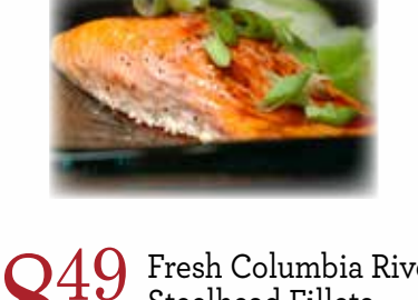
Fresh Columbia River Steelhead Fillets lb. Farm raised, subject to availability