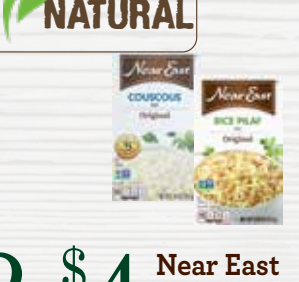
2^{\$}_{ m for}4^{ m Near\ East}_{ m Couscous\ or\ Rice}_{ m Selected,\ 5.4\ to\ 10\ oz.}