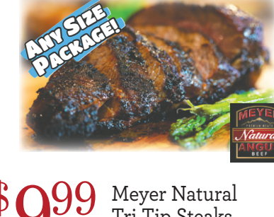
Meyer Natural Tri Tip Steaks